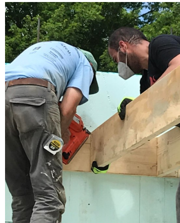
Work has resumed at our building sites at McFarland Meadows with new health & safety procedures in place.