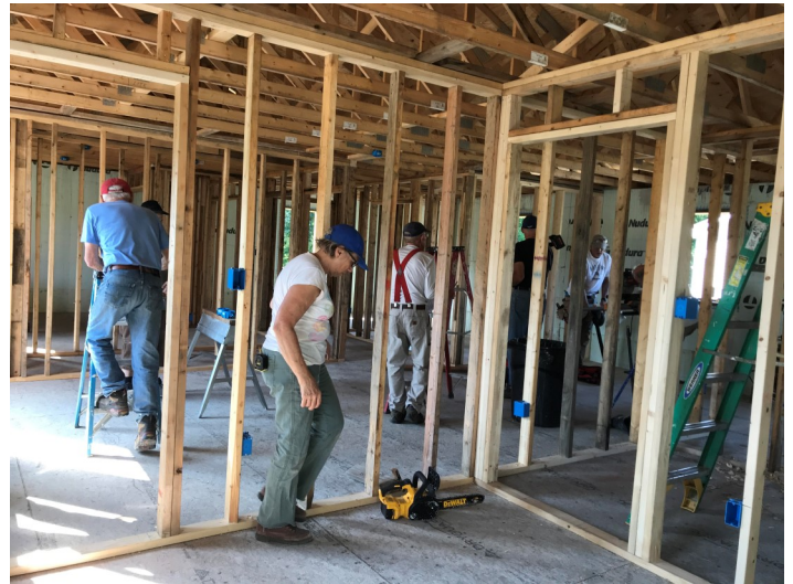
Volunteers working on framing out interior walls inside house #4 at McFarland Meadows.