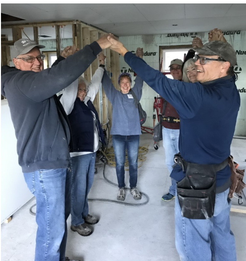
The Care-A-Vanners reciting their morning cheer—"Not a hand out, a hand up!"

The Care-A-Vanners set up their RVs at the Susquehanna Trail Campground which was a wonderfully convenient location for easy access to the build site and to town. We thanked them for their hard work with a welcome pot luck dinner, then an ice cream social on their last day. It was marvelous to be able to welcome visitors to our unique build site and hear stories of their experience helping at Habitat chapters across the U.S.