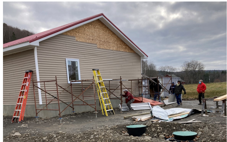
The last of the siding going up on lot #4 at McFarland Meadows just before we finished work in fall 2021.